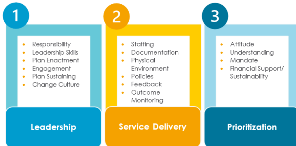
Figure 1. Kapwa Kultural Center & Cafe Evaluation Domains

taking this approach allowed for collection of robust qualitative findings on program development.