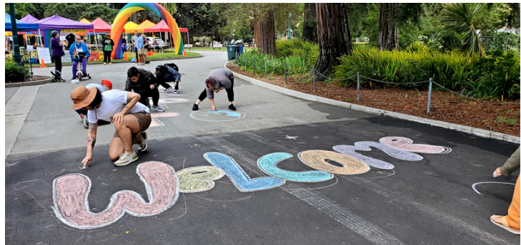
2023 Pride celebration preparation.

The 2024 San Mateo County Pride Parade and Celebration will take place on Saturday June 8. The parade starts at 10:30 am and will follow B Street from 2nd Avenue and ends at Central Park, 50 E 5th Street, San Mateo, where the celebration will take place from 11 am-5 pm. Both events are open to all at no cost and are sober events! Visit smcpridecelebration.com for more information. Volunteers for both the parade and celebration are still needed. Fill out a volunteer form to help make these events a success!