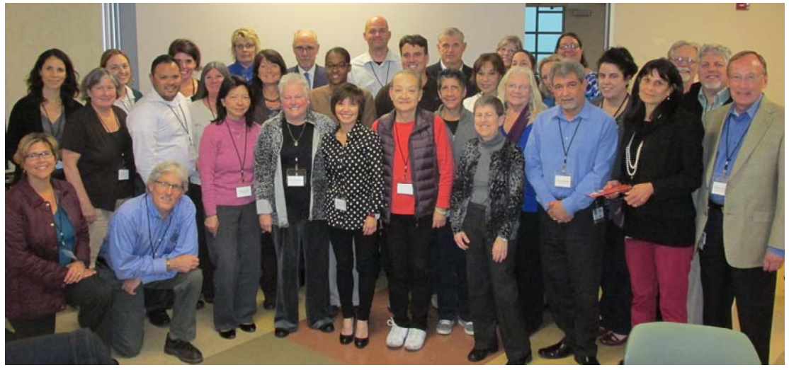
Staff from various BHRS countywide programs participate in the CSA integration workshop.

To learn more about the CSAs, visit www.smchealth.org/goodandmodern