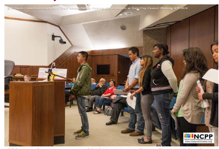
BTC Youth Council presenting 2013 Youth Access Survey Findings & Rec Report at Daly City Council Meeting, June 2014.

At the City Council meeting on November 10th, Daly City passed a Social Host Ordinance (SHO). The SHO expands on the existing Loud and Unruly Party Ordinance, and holds adults responsible for underage drinking occurring in their home. Under the new ordinance, police officers are allowed increased authority to investigate when dispatched to the scene of a loud and unruly party where underage drinking is suspected. If officers determine that underage drinking has occurred, parents/guardians face fines of $1500 for the first offense. $2000 for the second offense, and $2500 for the third offense. The SHO is meant to serve as a deterrent, encouraging parents to have conversations with their children about underage alcohol use and its consequences. All of this comes on the heels of the 2013 Youth Access Survey conducted in the Jefferson Union High School District by Be The Change (BTC) youth