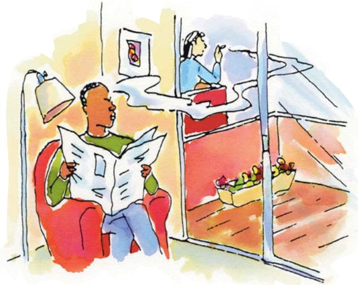
Illustrations by Janet Cleland © California Department of Public Health

As a general rule, it is unwise to file a lawsuit unless you have suffered significant harm. Your chance of convincing a court that you have a justifiable legal claim is far better if you can show that you have been harmed badly by repeated, unwanted exposure to secondhand smoke in your apartment—for instance, if you have visited a doctor with frequent respiratory complaints, missed work due to illness caused by the smoke, stayed away from