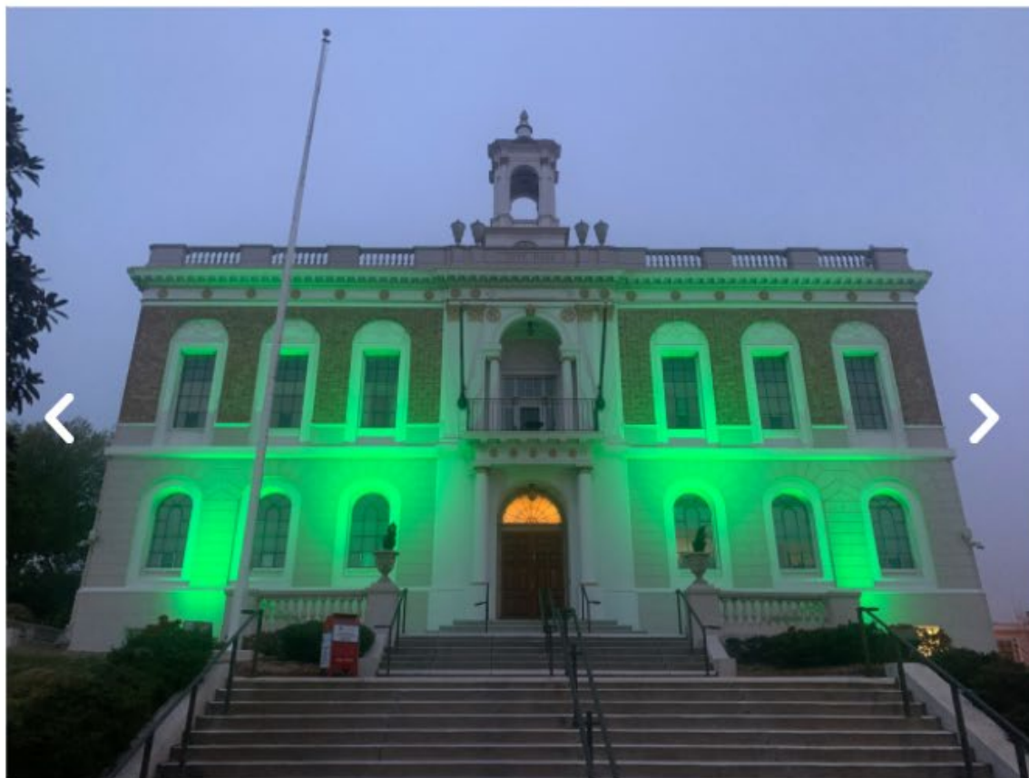
South San Francisco